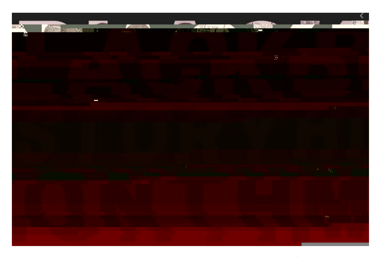
Black History Month is an annual celebration of achievements by African Americans

I hope this newsletter finds you all doing well. As we launch into the spring semesterÁ it's critical to engage our students early with an ethic of care. Be sure to reach out toÁ students regularly letting them know PC is ready to <a href="support">support</a> their academic and non-academic needs. This edition will cover Black History Month, PC's sabbaticalÁ winners, STD Awareness, Future of Work Summit, Learning Commons Support, andÁ OER opportunities.